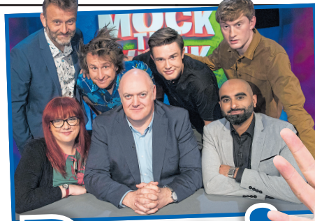
LESSONS IN FUN: Dara and, left, with Hugh Dennis and other stars on Mock the Week